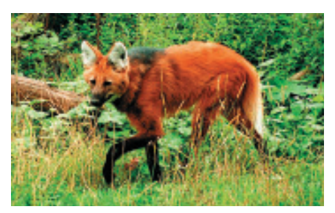
The rare maned wolf lives in our forests