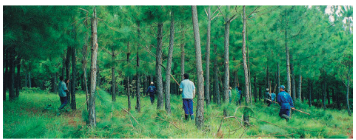
Forest workers caring for the trees

Planting alone is not enough for Faber-Castell. It is also vital to preserve and enrich the native species of the Brazilian savannah trails and forest. So as to put into practice its commitment to the environment, Faber-Castell Brazil developed three projects in addition to the pine plantation: Arboris , Animalis , and ECOmmunity . The objectives of the Arboris project are to preserve and value the regional native flora, allowing its natural regeneration. In areas where natural treatment is not possible, native trees relevant to the local fauna are planted. The Animalis project pays tribute to the fact that the Faber-Castell woodlands provide a habitat for 178 bird, 36 mammal as well as 40 reptile and amphibian species, several of them of great scientific interest because they are threatened with extinction, for example the extremely shy maned wolf. A continuous monitoring conducted by biologists secures studies to preserve and increase the diversity of wild species living in small pockets of natural vegetation. The ECOmmunity project for the employees and the community in Prata aims at encouraging people to preserve natural resources. By 2006, the programme had already reached more than 35% of the local population. With its superior form of forest management, ecological conservation, and community education, Faber-Castell highlights once more its tradition as a responsible family business spanning several generations.