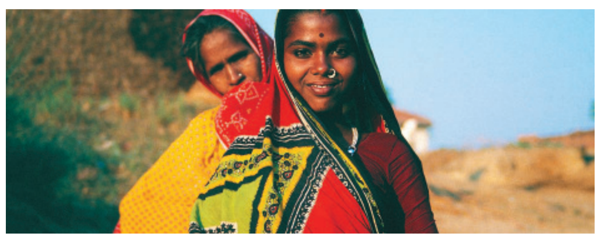
Public Private Partnership in India: suppliers are being gradually encouraged to implement the Faber-Castell Social Charter

In the medium term, Faber-Castell would like to extend the Social Charter to cover suppliers as well. The first step has been taken in India, as part of a PPP (Public Private Partnership) project implemented jointly with the GTZ (German Association for Technical Cooperation) and the IG Metall trade union. With the aid of an information workshop we were able to sensitize institutions and ministries, non-governmental organizations and trade unions, but also companies and local auditors to this topic. Four suppliers submitted themselves to a preliminary inspection by neutral auditors commissioned by the GTZ. That determined an initial situation which served as a basis for drawing up an activity plan divided into priorities. Roughly 15 months later, there was a follow-up audit in order to document the progress. The final report that came out of the audits now serves as the basis for extending the social standards to further suppliers, in India and in other threshold countries.